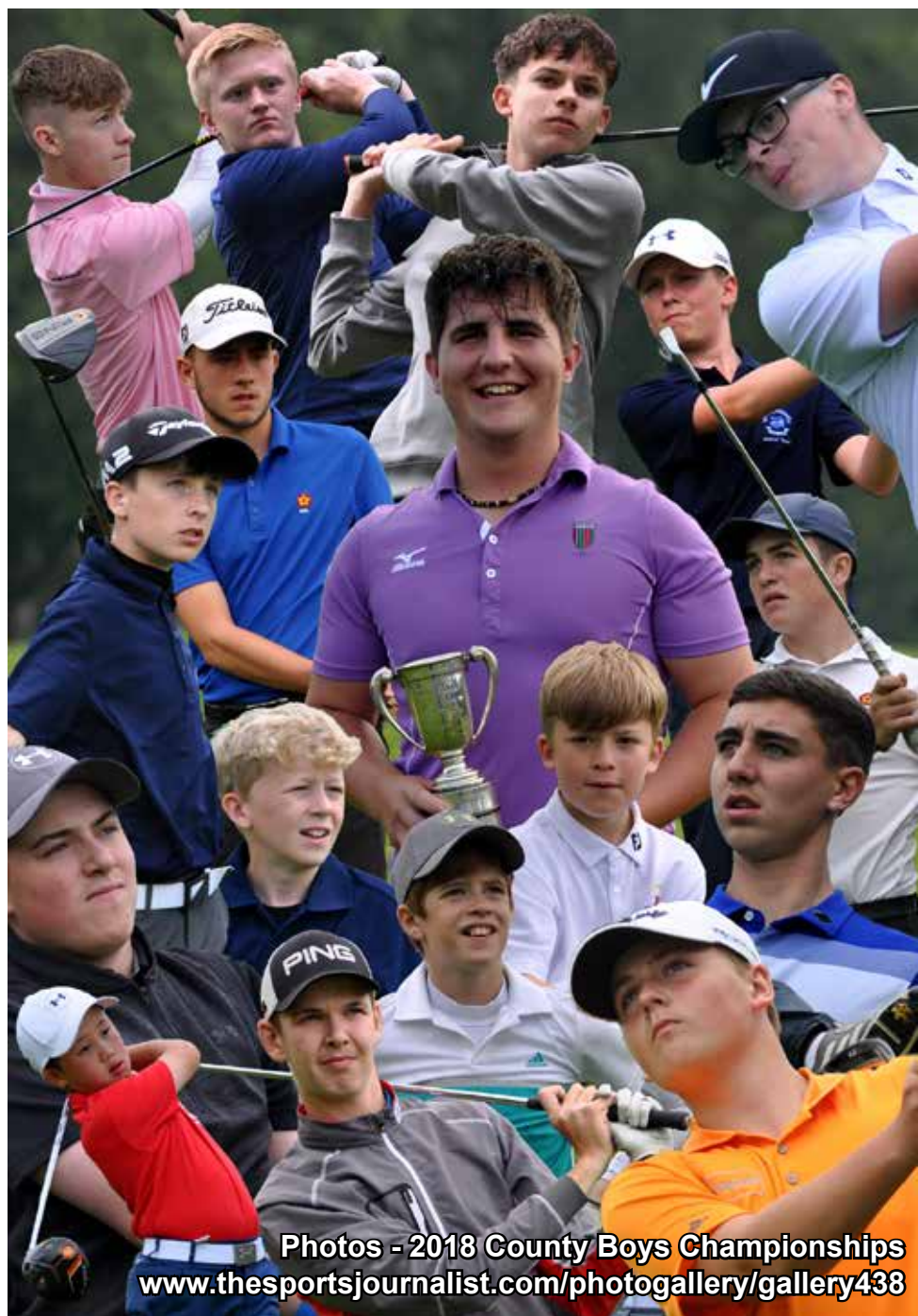
Photos - 2018 County Boys Championships www.thesportsjournalist.com/photogallery/gallery438