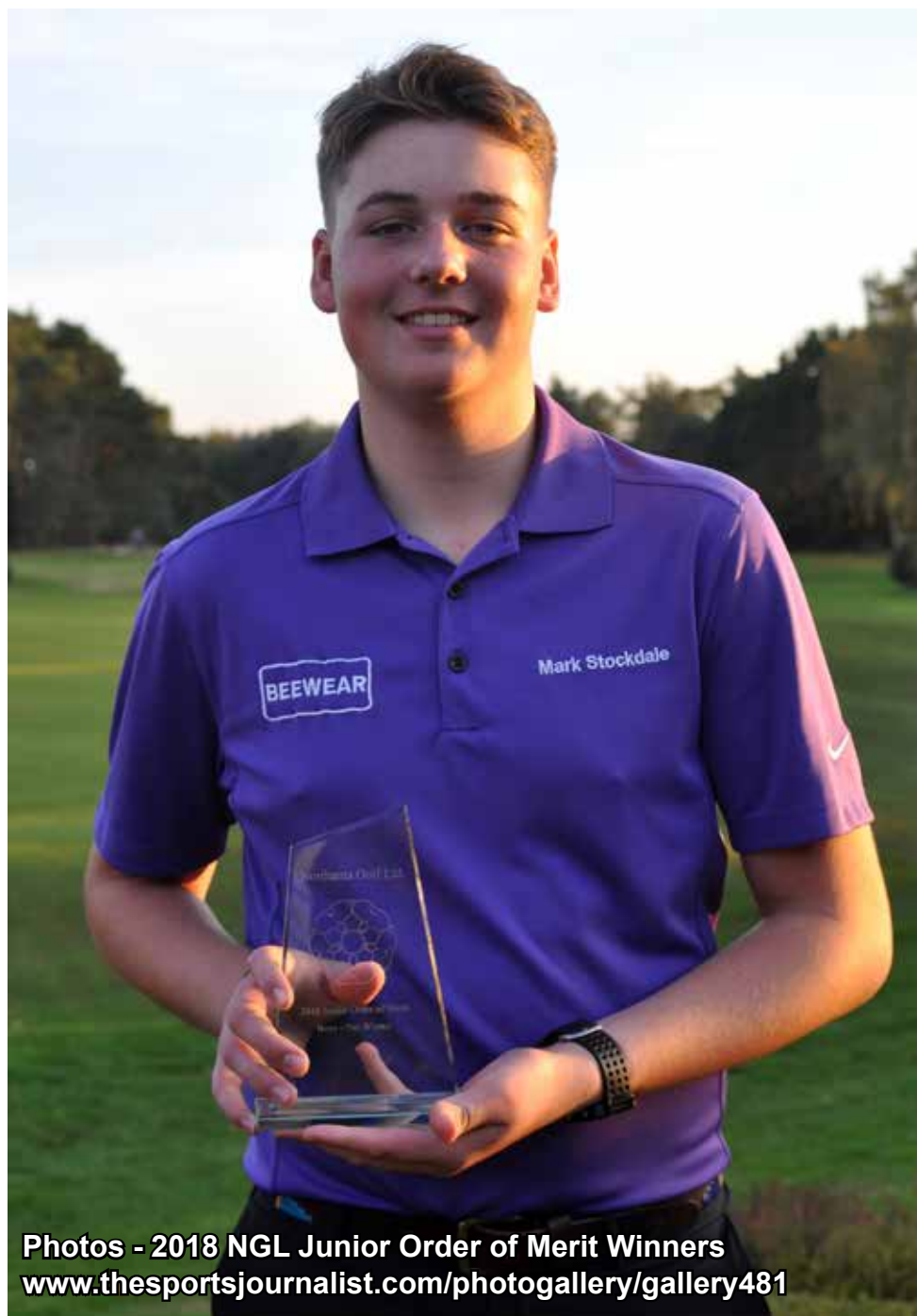
Photos - 2018 NGL Junior Order of Merit Winners www.thesportsjournalist.com/photogallery/gallery481