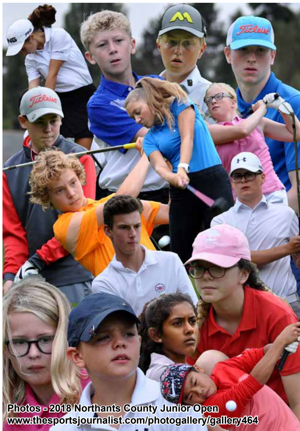
Photos - 2018 Northants County Junior Open www.thesportsjournalist.com/photogallery/gallery464