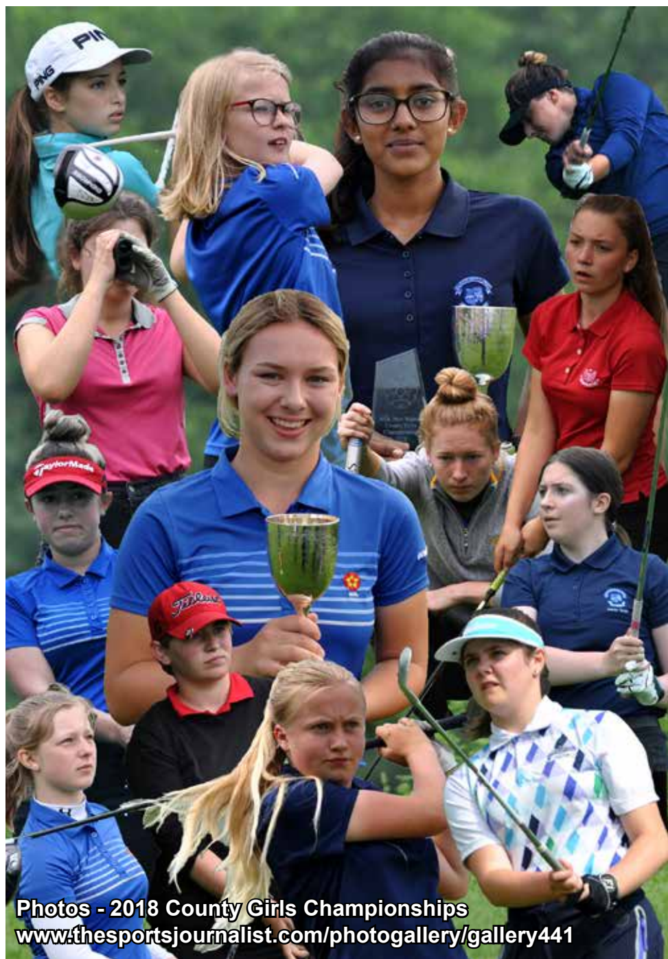
Photos - 2018 County Girls Championships www.thesportsjournalist.com/photogallery/gallery441