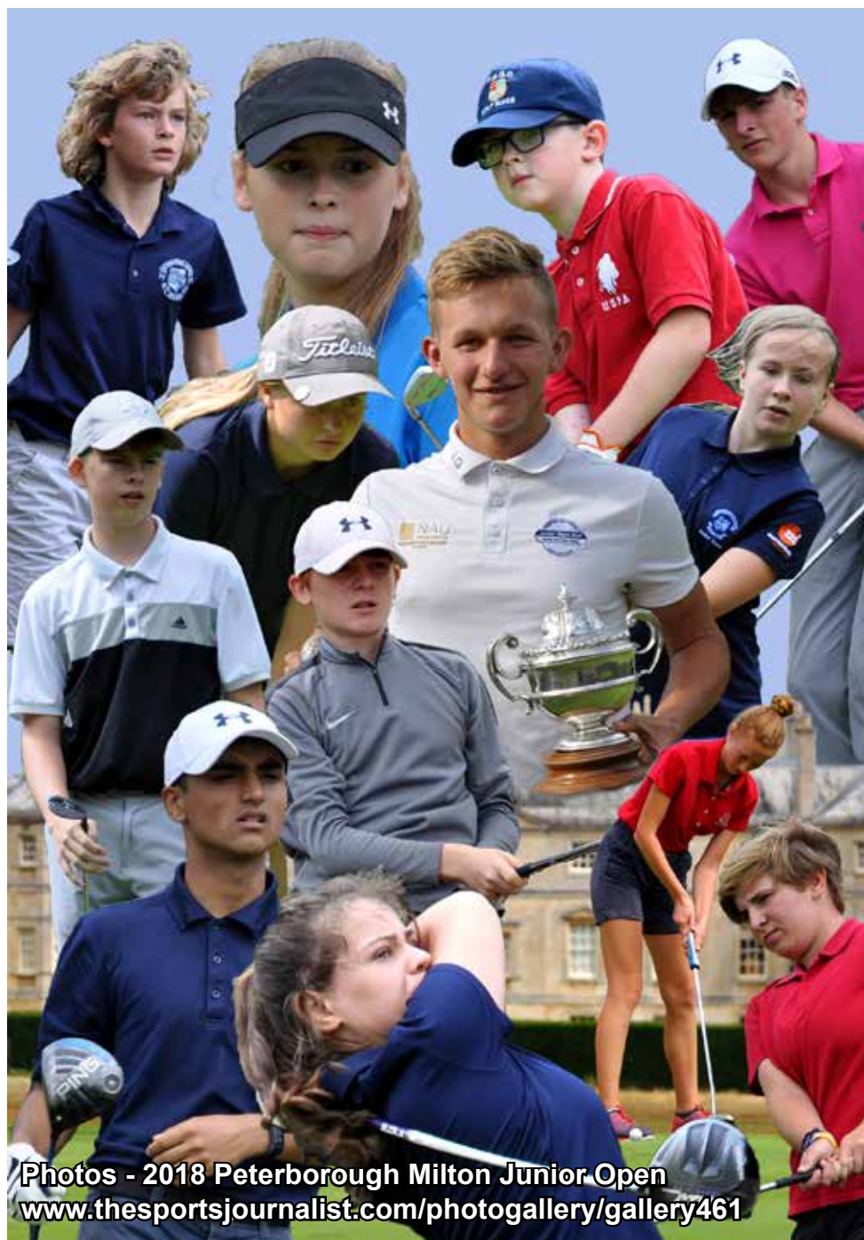
Photos - 2018 Peterborough Milton Junior Open www.thesportsjournalist.com/photogallery/gallery461