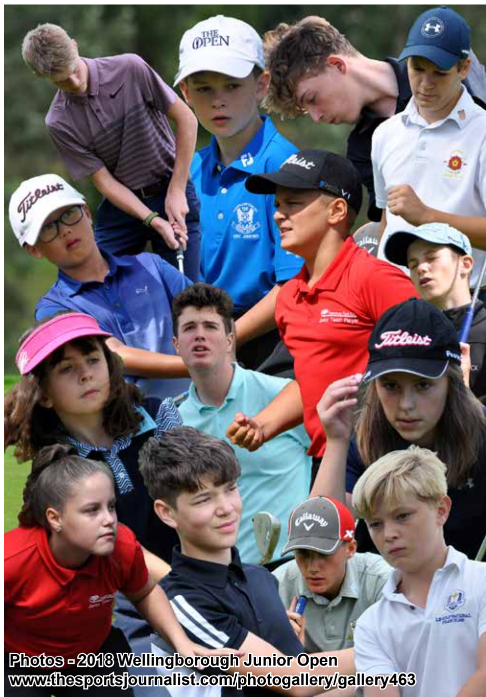
Photos - 2018 Wellingborough Junior Open www.thesportsjournalist.com/photogallery/gallery463