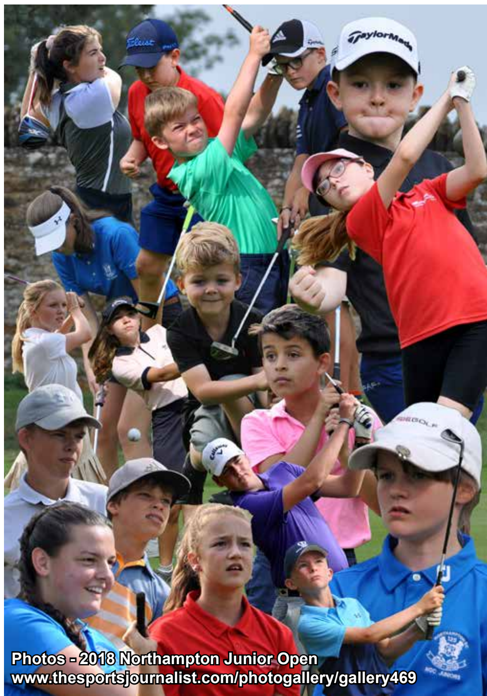
Photos - 2018 Northampton Junior Open www.thesportsjournalist.com/photogallery/gallery469