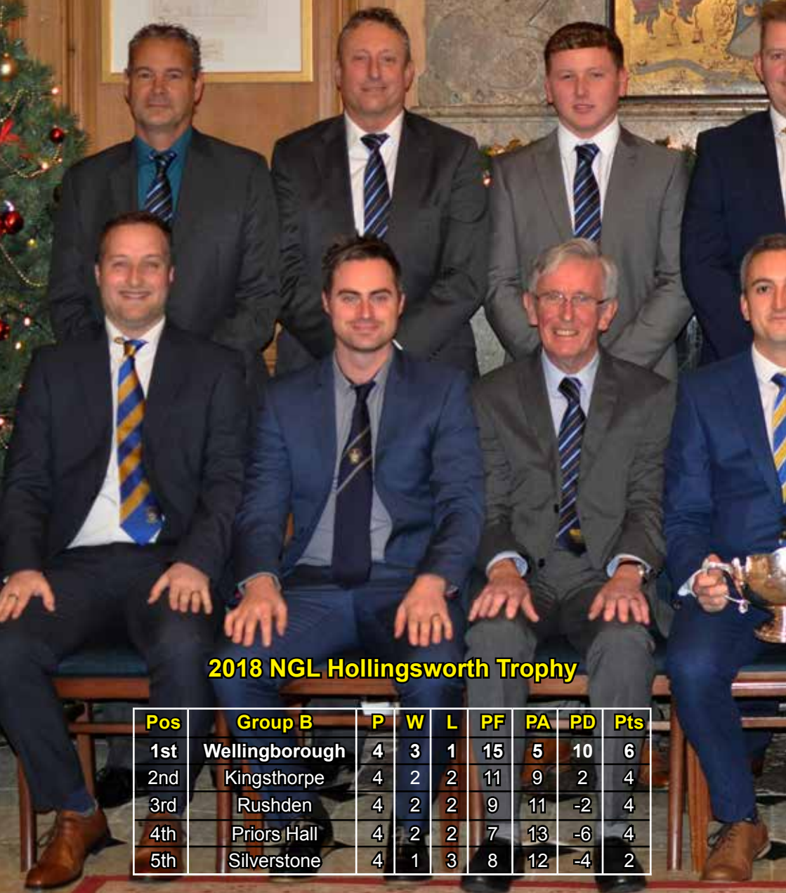
2018 NGL Hollingsworth Trophy