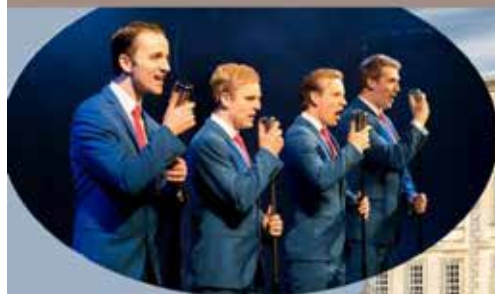
Dancing to Jersey Boys tribute act 'The Other Guys'